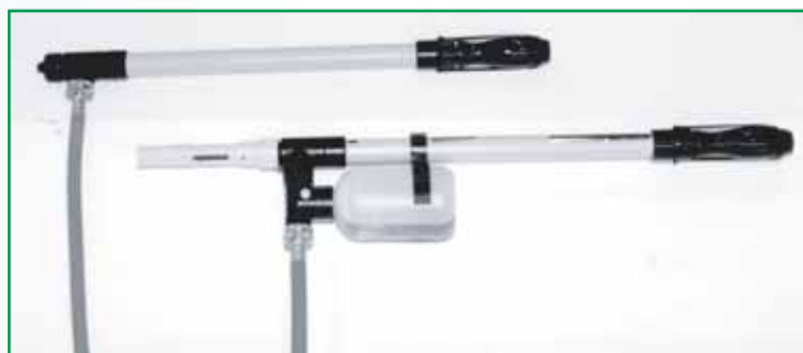
Top pump: Standard (water only) Bottom pump: Foam capability